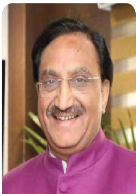
Ramesh Pokhriyal Union Education Minister